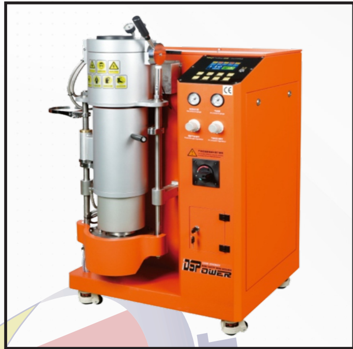
Vacuum Pressure Casting Machine