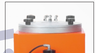
Wax Chamber Lid