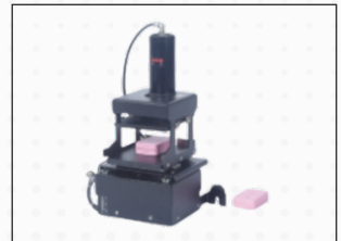
Movable Auto Clamp