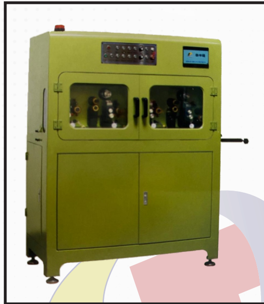
Four- Axis Diamond Cutting Machine